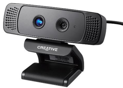
Figure 1: Senz3D Camera 1

the outputs of the Raspberry Pi itself, being sent over a Wi-Fi dongle. Wi-Fi was chosen because of the abundance of bandwidth that was not available with other mediums. The Surface mentioned above will receive the Wi-Fi video feed and display it for the user. A rough assembly of this design can be seen below in Figure 2. In this design there is a small servo motor added to the elev-8 to rotate the camera from straight forward to 90 degrees downward to look below the elev-8. This was done using channel 6 in the radio frequency transceiver that was not being used prior. It will be controlled through gesture motions that will be discussed later.