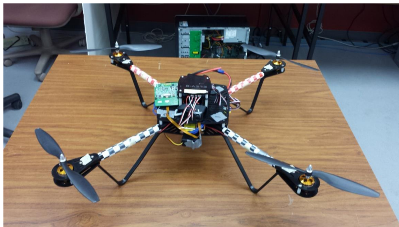
Figure 2: Conceptual Design