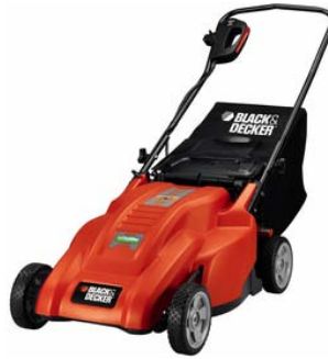
Figure 1. Black & Decker Electric Mower [10]

The analysis was done by calculating the power output (cuts through tougher grass). The cost of use were determined by which mower cost is lower (retail value and operation cost). The emissions are considered in the analysis because not only do they harm the environment but also the owners health.