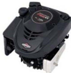
Figure 3. Briggs & Stratton 725ex Series Engine [10]

where P_{in} is the input power of the mower, from lithium-ion battery, that will vary from a batteries capacity. P_{out} is the output power of the electric mower and will be a fixed value as stated in the manual. The efficiency will state how much of the power is being utilized. W_{out} is the output power generated by the gasoline mower. This varies from engine capacity. Q_{in} is the heat transformed into mechanical energy, and the \eta_{th} represents the efficiency. The following image shows the engine we analyzed in order to make comparison.