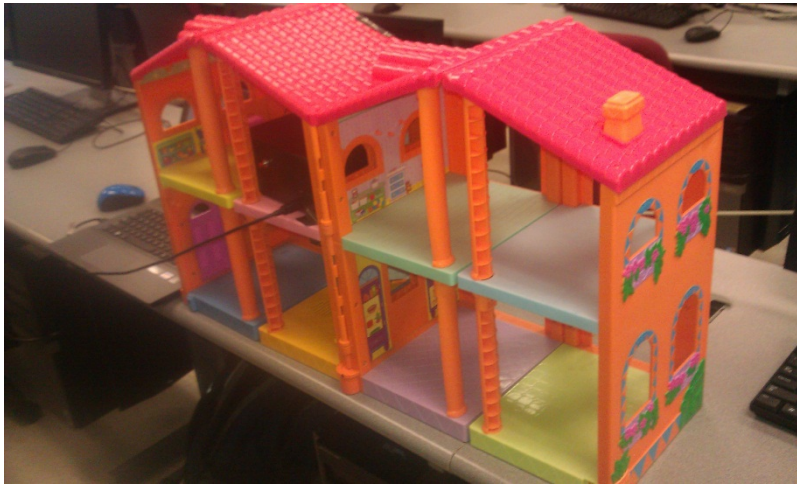
Figure 2 Doll house used to model the security system. Note the black housing in the upper level, with an on/off switch for the system incorporated.

program could be controlled by a user in the house. The system in Figure 3 used four sensors, and hid the controller and breadboard in the “attic” part of the building.