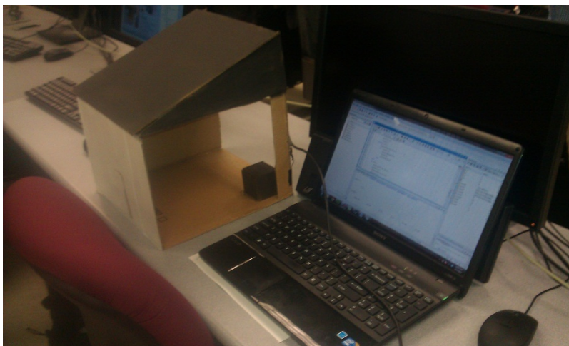
Figure 3 Example of one of the projects that used four sensors. The controller and breadboard were hidden under the roof, and the wiring was neatly run along the walls. Some of the MATLAB control can be seen on the laptop screen.

The additional effort that students put into the project translated into a better experience, and possibly improved learning, as they reported themselves. Written feedback was taken from the standard student evaluations done at the end of the semester. No special feedback or surveys were requested, so student feedback about the final project was spontaneous and not elicited. Written feedback about the hands-on project was quite positive.