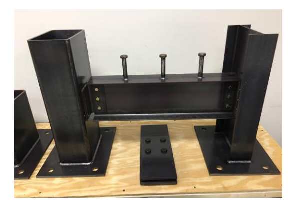
Figure 7: Composite Beam and Bolted Connection Model