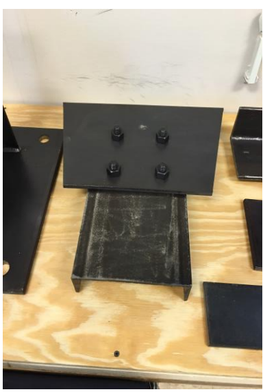
Figure 4: Bolted Channel-Plate Model