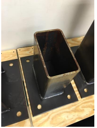
Figure 6: HSS Column and Baseplate Model