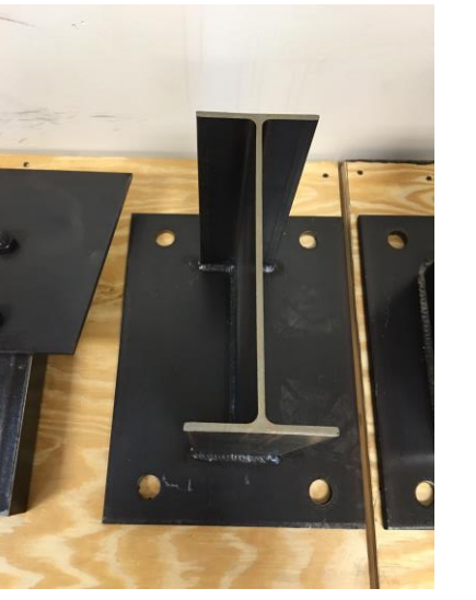
Figure 5: WF Column and Baseplate Model